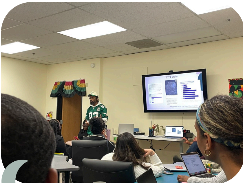
HCN's SUD Program Coordinator presenting on SUD in SF.

A series of focus groups were implemented by the Indigo team to collect process evaluation data. Focus groups were scheduled regularly between February and June 2025 with CHOPP and HCN leadership to examine and understand the administrative organization of the program and implementation. Finally, we utilized administrative data tracked by the CHOPP team.