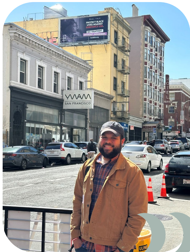
HCN's Director of Africentric Programming.

For the 2024-2025 fiscal year, CHOPP successfully met all of their performance goals. As CHOPP's inaugural year, performance objectives focused on building strong foundations for the program, infrastructure, and garnering community insight to understand needs and strategies. The objectives are outlined in the table on the following page.