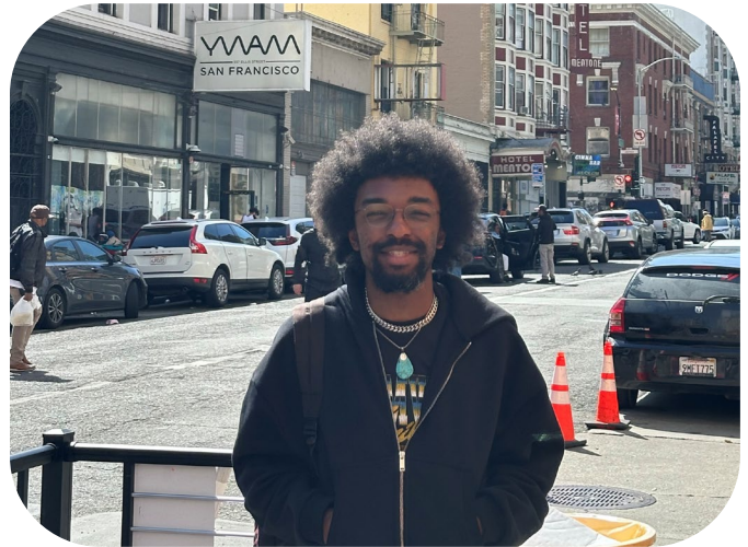
HCN's SUD Program Coordinator.

First, the Program Director and Coordinator began regularly attending DPH Stakeholder Meetings in September. Through these meetings, the team heard from various community partners on different perspectives and community needs surrounding SUD treatment and prevention.