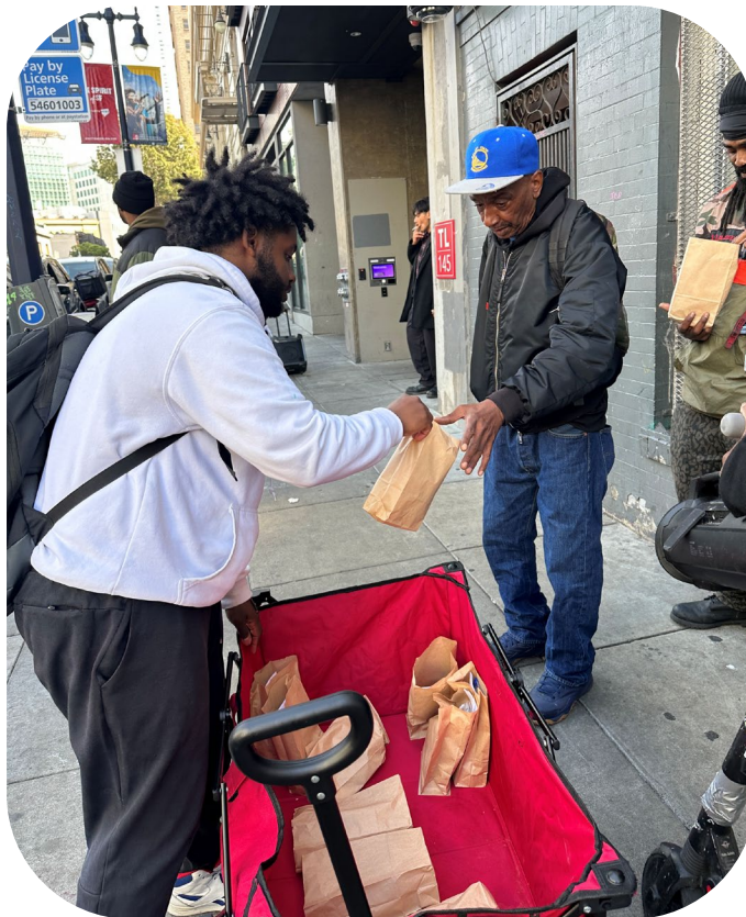
Care packages, including community resources, substance use service resources, and snacks.

Nearly 95% of respondents shared that they would prefer to engage in a free workshop or training to learn more about overdose prevention. Additionally, participants highlighted that they would like to receive information about overdose prevention through trusted community organizations and/or peers. Third, respondents noted that receiving information through community events would be helpful in bridging engagement in harm reduction knowledge building and practices. Finally, survey participants named a plethora of organizations and trusted leaders in the community that CHOPP could seek partnership with, building upon the program's network of support to offer participants. These responses from surveyed community members are incredibly useful in informing the types of activities CHOPP provides to the community and partnerships that should be made in order to bring awareness to services.